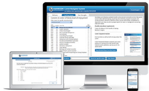
Online Interactive Career Portal